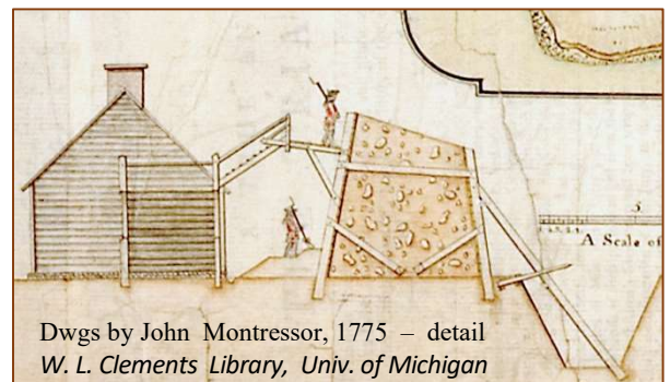
Earth-filled defensive redoubt on Bunker Hill 1775 similar to what could have been built at Marblehead